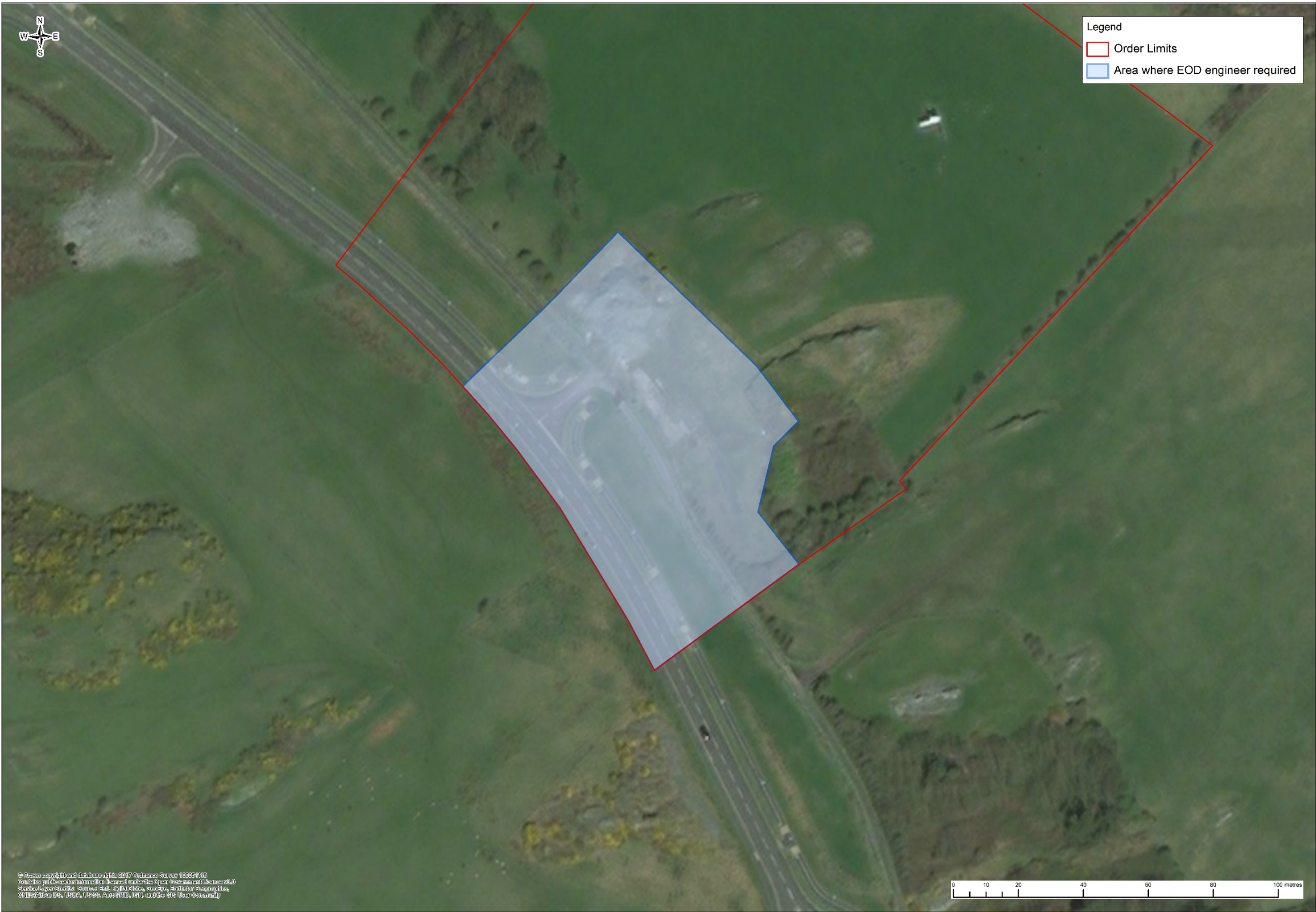
Figure 4-1 Area where EOD engineer required